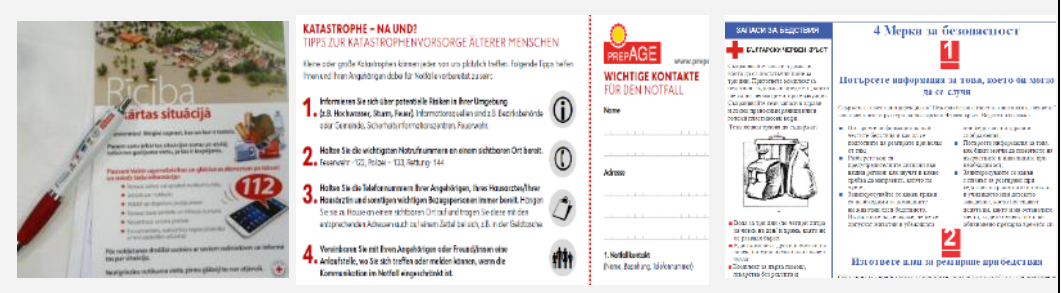
Emergency information leaflet (Latvia), Emergency card (Austria), Familiy preparedness plan (Bulgaria)

The information leaflets were received very positively by the local stakeholders participating in the exercises. In Latvia, local authorities asked for additional copies to distribute them to older people in several communities and the Latvian Red Cross had to print additional copies. One of the property management agencies involved in the exercise in Austria, asked for additional copies of the recommendations and guides so that they could disseminate them to their staff members. Also, they asked for 6000 copies of the information leaflet on disaster preparedness for older people, because they would like to distribute them to all their tenants in 6000 apartments. The British Red Cross is now sending out a marketing campaign to 200,000 people using the materials we designed for the PrepAGE exercise in the UK – a grab bag and emergency contact lists.