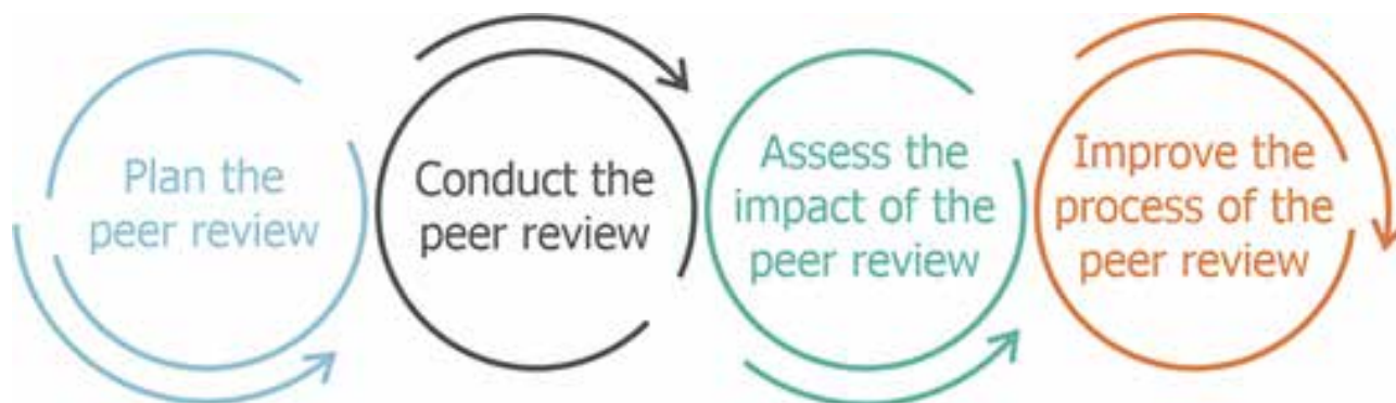
Figure 1 - Main phases of the peer review process according to ISO22392:2020 (own graphic elaboration).

assessment of the impacts, and evaluation of the review process and its outcomes (Figure 1).