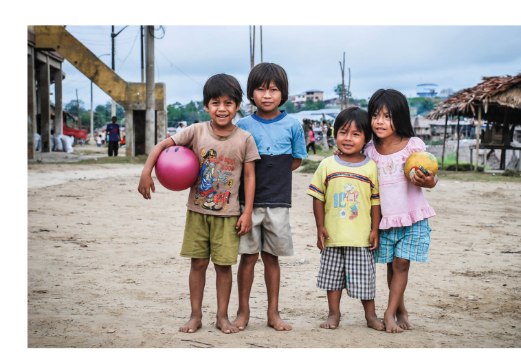
Children in areas hit by floods in Peru.

For example, perpetrators may reduce or put a halt to their actions against the civilian population, or shift to a less harmful approach when conducting their hostilities/activities (avoiding food blockades, forced displacement, restrictions of movement, etc.). Or they may improve their compliance with international human rights and humanitarian law standards, e.g. when a commander issues strict orders against rape and mistreatment of civilians.