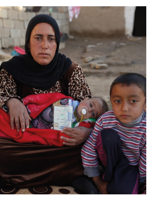
Free legal assistance helps Iraq's displaced to access their rights.

Likewise issues of social exclusion and discrimination should be considered in the analysis.<sup>72</sup> Groups, households or people facing such issues will often be hidden in the communities and be systematically excluded from participation in community-based consultation and participative processes. Thus, while community-based targeting methods might be useful, as often communities will intuitively define households whose members undertake risky and degrading behaviours as being vulnerable, there might be an important