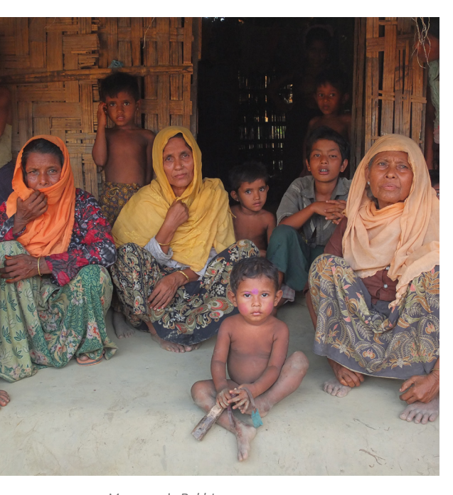
Myanmar's Rakhine State: different realities of displaced, confined and resettled communities.

accordance with the principles of humanity and impartiality, the Commission follows a needs-based approach and allocates its resources to those with the greatest needs and highest levels of vulnerability in an unbiased manner and enabling beneficiaries to maintain their dignity. The needs-based approach is informed by rights and therefore it is NOT in contradiction with the rights-based approach to guide the design and implementation of humanitarian assistance in a manner that, consistent with human rights principles, those in need of assistance are respected as rights-holders.