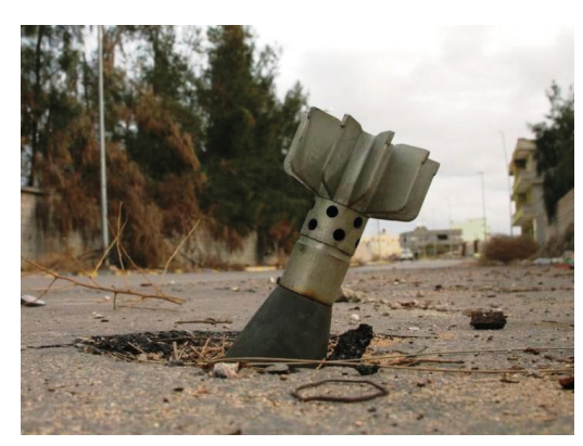
Clearing the remnants of fighting in Sirte, Libya.