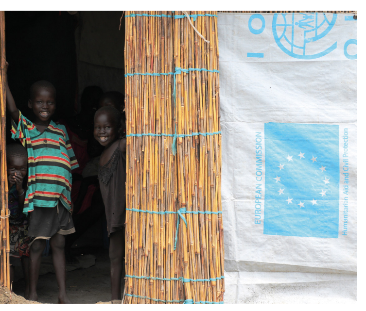
South Sudan: displacement in Unity.

Recent extensive studies<sup>73</sup> show that livelihoods, cash transfers and protection are intimately linked, and customary law, local values and traditions may often matter a lot, in addition to formal human rights. One of the recommendations is putting the community's perspective and participation at the centre and allow for a holistic response addressing physical safety, livelihoods, and psychosocial needs.