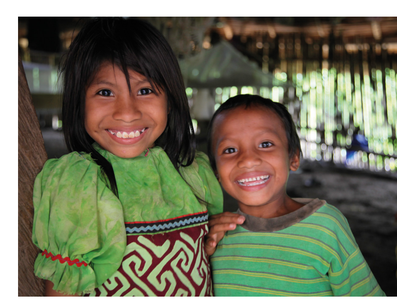
Colombian indigenous children.

providing it. Stored information may be lost, hacked or stolen. The protection actor seeking and managing the information bears the responsibility for managing the risks associated with the process (all protection actors should have policy or guidelines on this topic or make use of existing ones).<sup>78</sup>