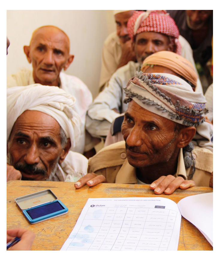
Yemen – cash distribution.

• Protection actors setting up systematic information collection through the Internet or other media must analyse the different potential risks linked to the collection, sharing or public display of the information and adapt the way they collect, manage and publically release the information accordingly.