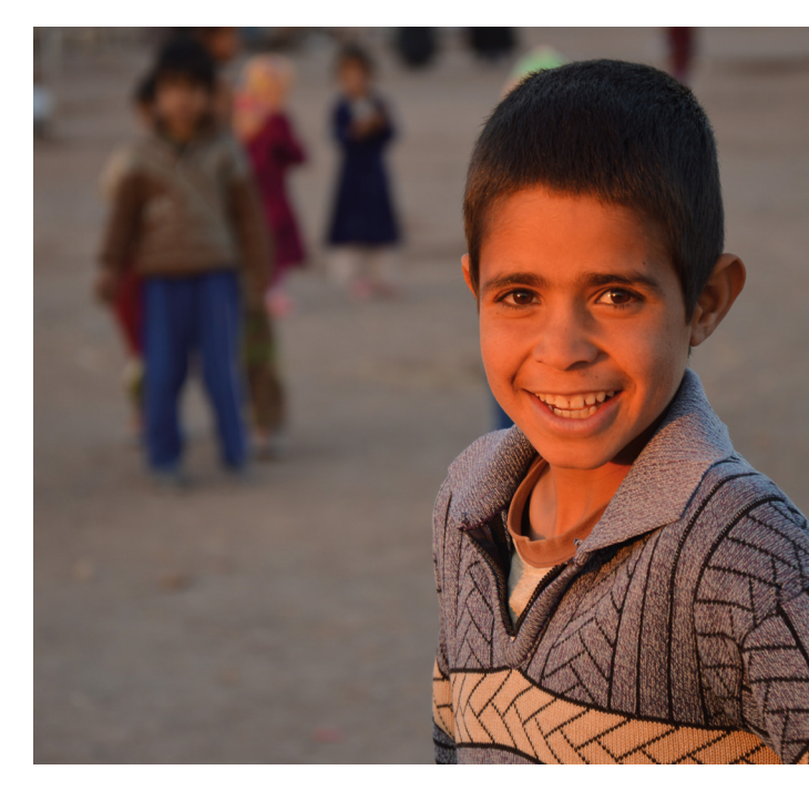
Afghan refugees in Iran.

Risks can be defined as foreseeable potential situations that might affect the implementation of the action, without necessarily excluding its further implementation, but requiring specific measures aimed at reducing them.