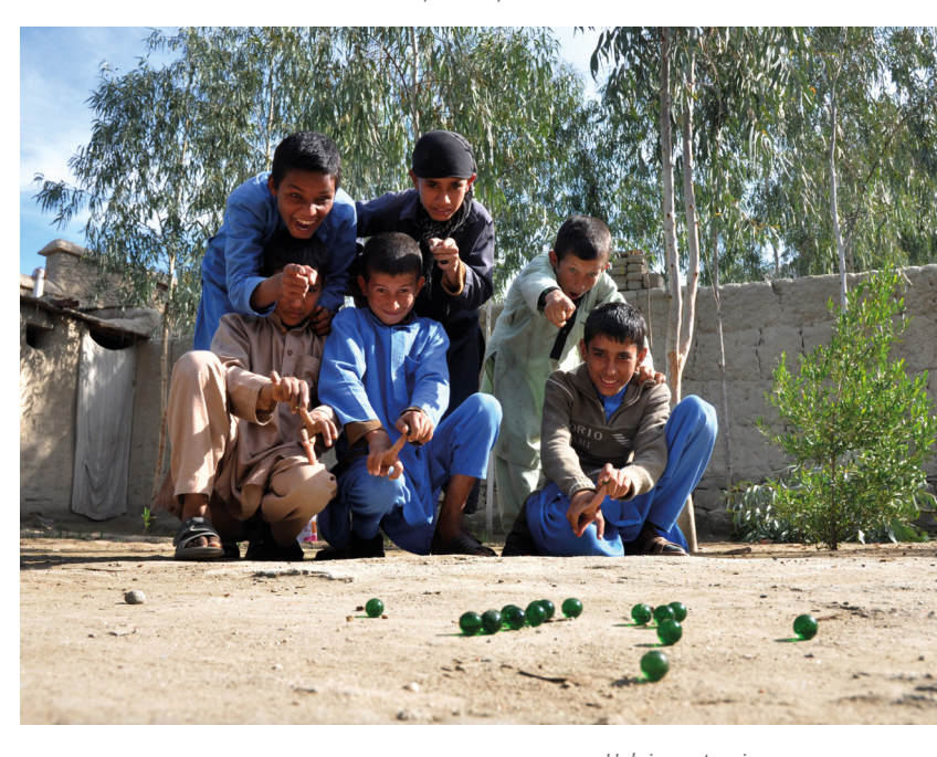
Helping returning refugees settle, Afghanistan.