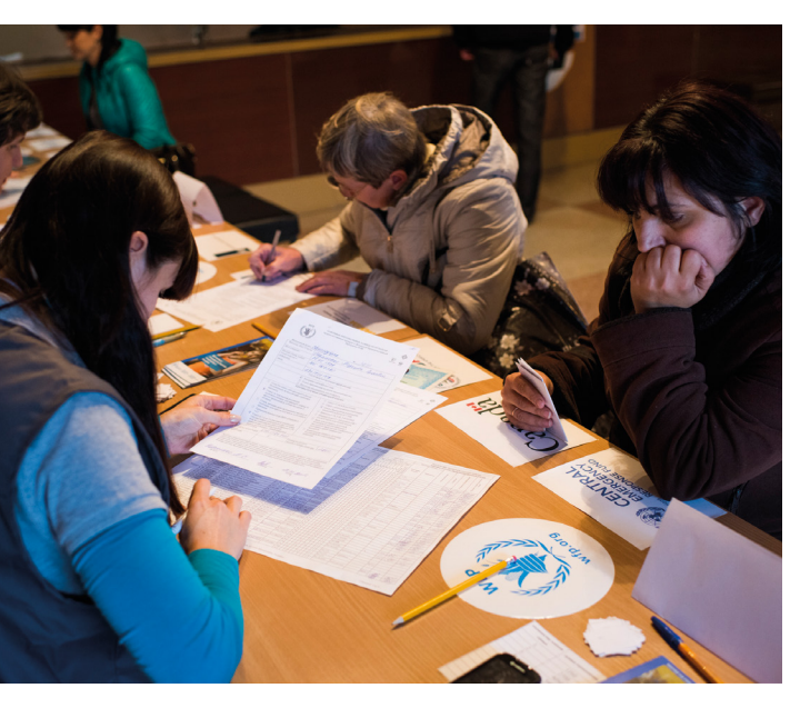
Ukraine: Helping people caught on the frontline.

Output indicators for protection measure the specific steps and measures taken by the project to influence the behaviour of key, primary and duty-bearer. Outcome indicators for protection capture the change in the threats and vulnerabilities as well as the