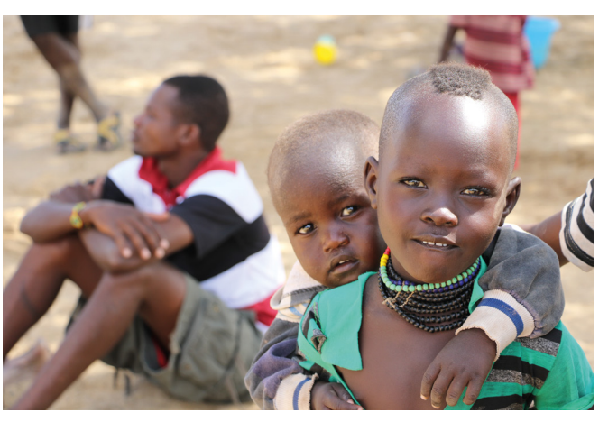
Kenya: EU humanitarian aid in Turkana