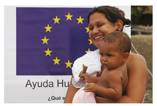
Restoring hope, Colombia.