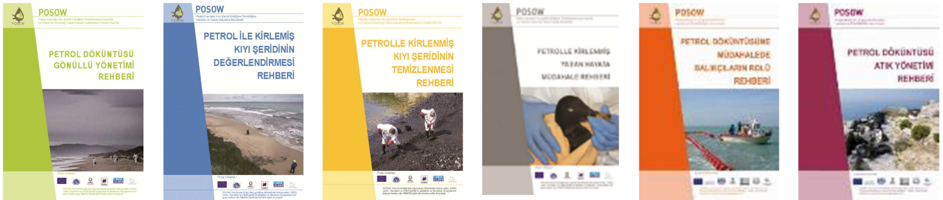
Turkish version of the 6 POSOW manuals

All the training material developed during POSOW I and POSOW II were translated into Arabic and Turkish. The six manuals, sixteen posters, seventeen Power-Point presentations and six Instructor manuals are available on the posow website.