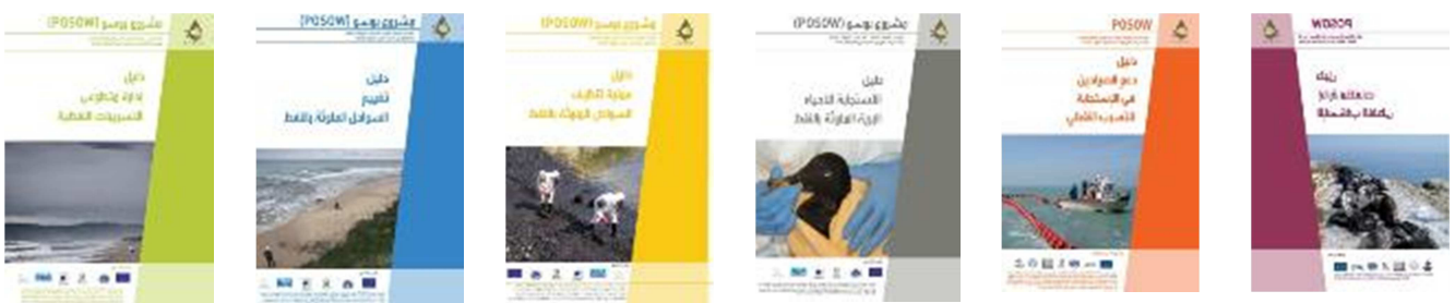
Arabic version of the 6 POSOW manuals