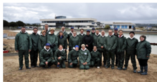
Train the trainer course n°2