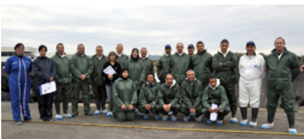
Train the trainer course n°1

A total of 32 trainers from the 7 targeted countries (Algeria (5), Egypt (4), Lebanon (6), Libya (1), Morocco (4), Tunisia (6), Turkey (6) and 2 trainers from Portugal were trained. Each country was provided with a set of training material in local language to duplicate the training courses.