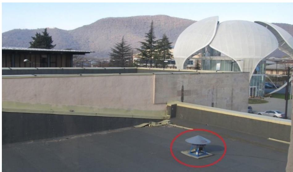
Figure 4 – siren in Kvareli

installed in places with easy access for installation and maintenance, they might not be the most effective for alerts (Figure 4).