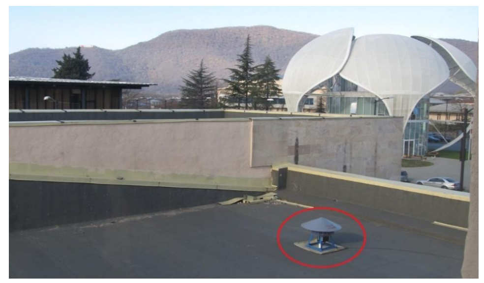
Figure 4 — siren in Kvareli

installed in places with easy access for installation and maintenance, they might not be the most effective for alerts (Figure 4).