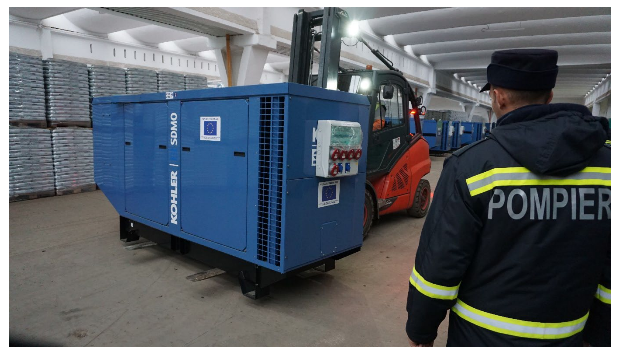
Delivery of rescEU power generators to Ukraine

In the context of Russia's war of aggression against Ukraine, the Union Mechanism has provided life-saving assistance with the largest and most complex EU civil protection operation since its establishment. It has delivered over 80,000 tonnes of in-kind assistance to Ukraine and its neighbouring countries, worth some EUR 500 million.