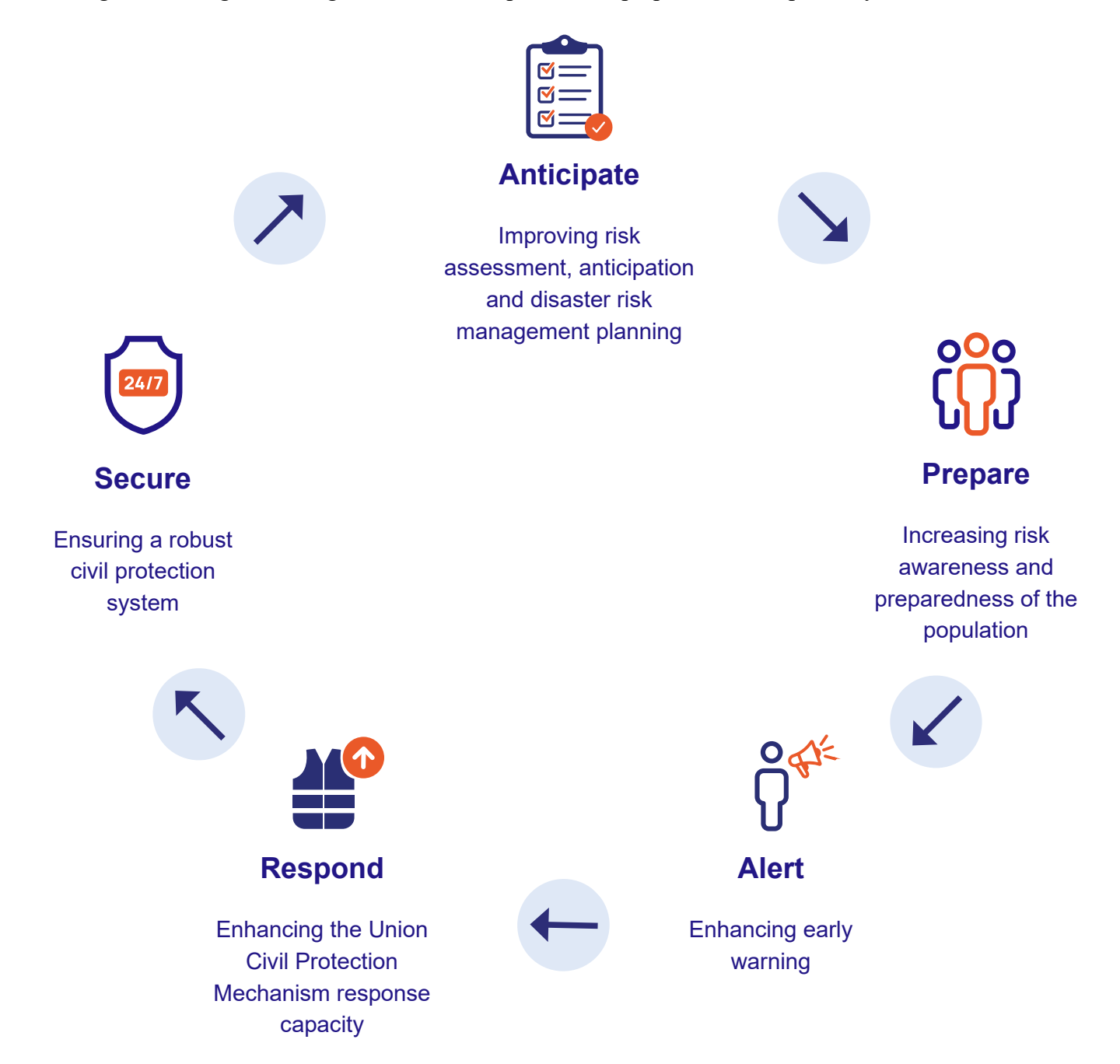
Figure 1: The goals strengthen the disaster prevention-preparedness-response cycle

The disaster resilience goals strengthen the EU's efforts to make resilience a new compass for EU policymaking.<sup>11</sup> The Commission's Strategic Foresight Agenda and the disaster resilience goals share a common objective, namely placing resilience at the heart of EU policymaking. Both look at the future to inform present decisions, drawing upon research, scenarios, trends analysis and other tools to increase Europe's resilience. The disaster