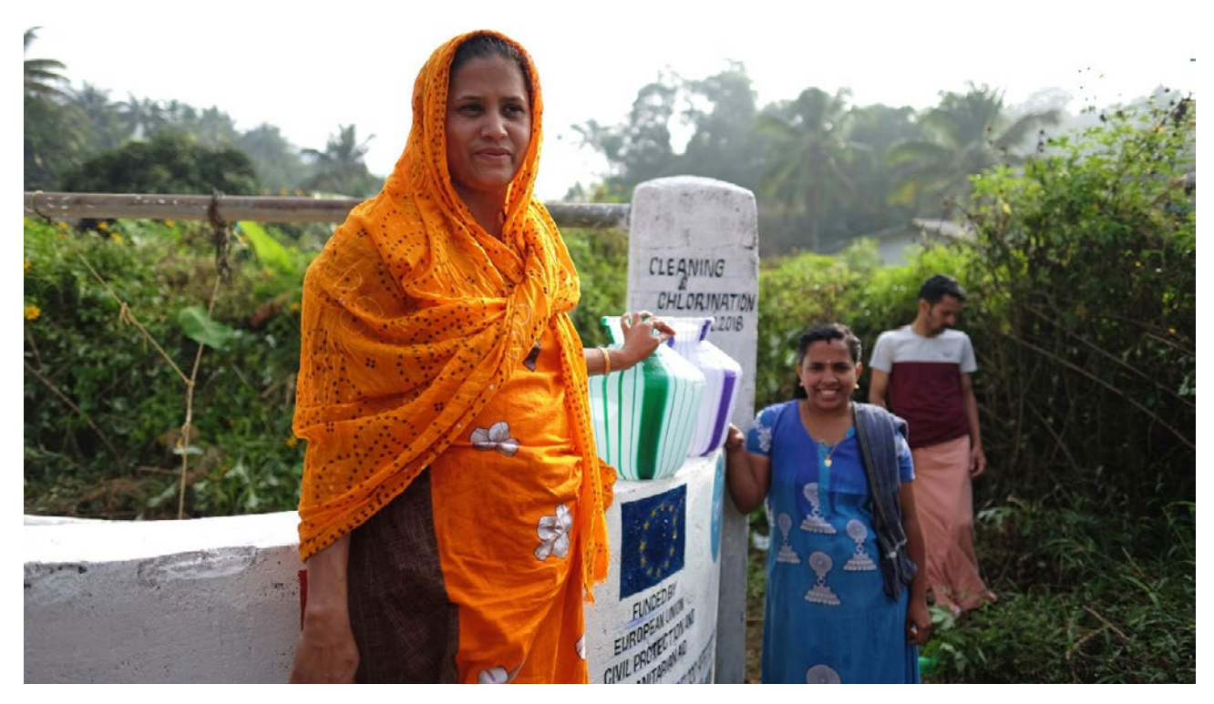
Providing support to flood-stricken families in India