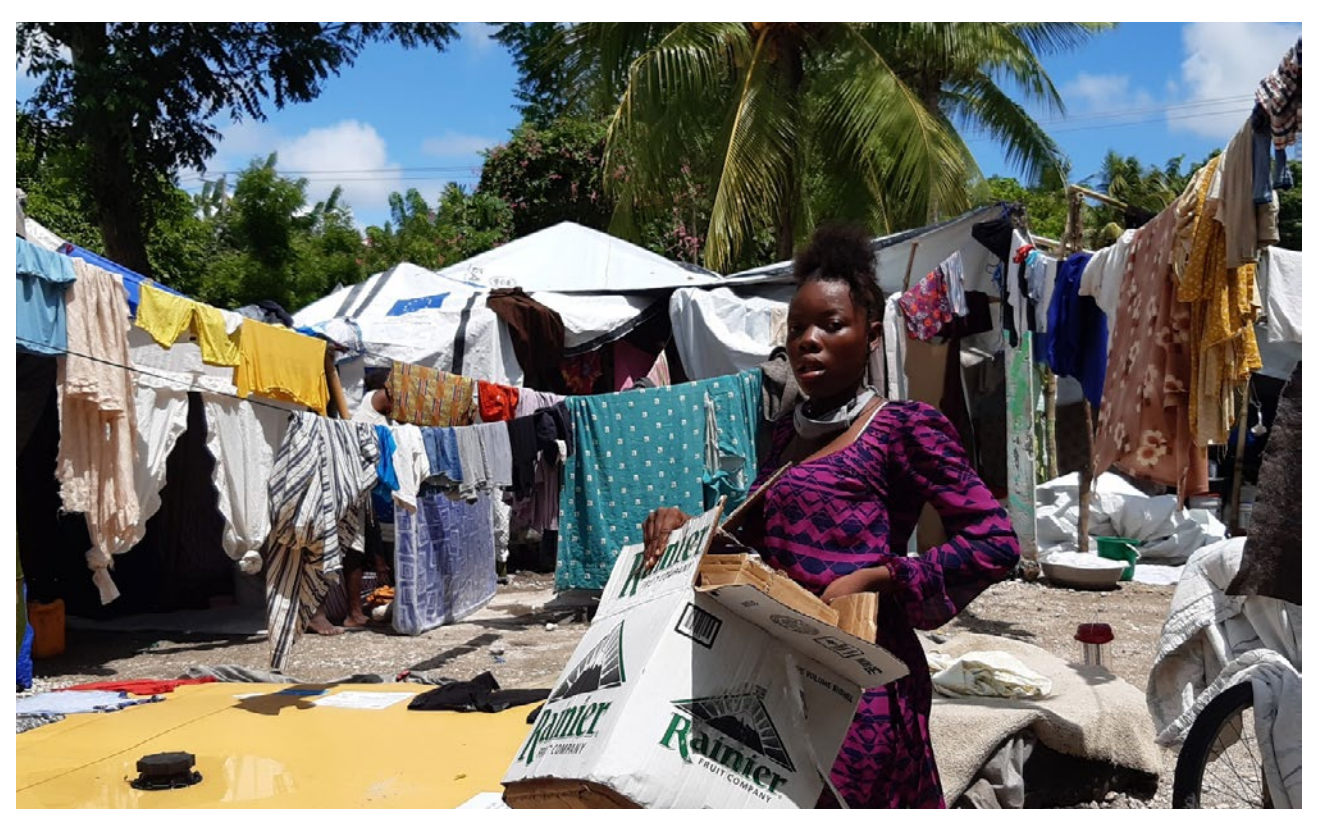
Haiti: EU response to devastating earthquake

Water at the Heart of Climate Action is a new initiative of EUR 55 million, funded by the Dutch Ministry of Foreign Affairs, and implemented by IFRC and the Netherlands Red Cross, UNDRR and WMO. The initiative is geared towards mitigating the impacts of water-related risks and disasters and increasing the resilience of vulnerable communities in Ethiopia, Sudan, South Sudan and Uganda. This initiative aims to enable different actors at global, national and local level to more effectively manage water-related risks. The Netherlands notes that global and national policies on climate, disaster risk reduction and water are often siloed and disconnected from, and not informed by the actors at, the local level. The Netherlands believes that to adapt to a changing climate, a combination of early warning and early action measures that support integrated water management is necessary to save lives and livelihoods in vulnerable communities. This initiative takes the local perspective as the starting point and includes vulnerable groups in the design of interventions aimed at reducing their vulnerabilities and strengthening their capacities. It focuses on long-term resilience strengthening measures and targeted action to improve the forecasting and early warning system capacity of regional and national actors.