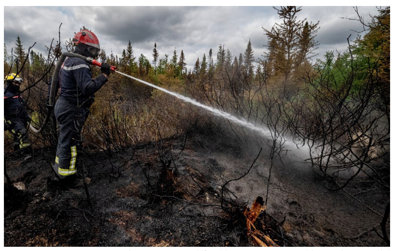
Canada: EU response to wildfires

The EU fosters cooperation and partnerships in several ways. For instance, the EU supports the need to strengthen the international framework for responding to the climate risks of today and the future, and that there is an urgent need to scale up financing, particularly to support the most vulnerable to deal with loss and damages resulting from climate change. Therefore, the EU welcomed the COP28 decision on the operationalisation of the Loss and Damage new funding arrangements and the Fund, to address climate related loss and damage in particularly vulnerable developing countries, while also supporting both the achievement of international goals on sustainable development and the eradication of poverty. The Fund was successfully launched with the European Commission pledging EUR 25 million and individual pledges announced by EU Member States amounting to over EUR 350 million. Equally relevant is the adoption of the UAE Framework for Global Resilience at COP28 and its agreed targets, which provides leverage for enhanced coordination and collaboration between existing structures and climate adaptation processes within and outside the UNFCCC.