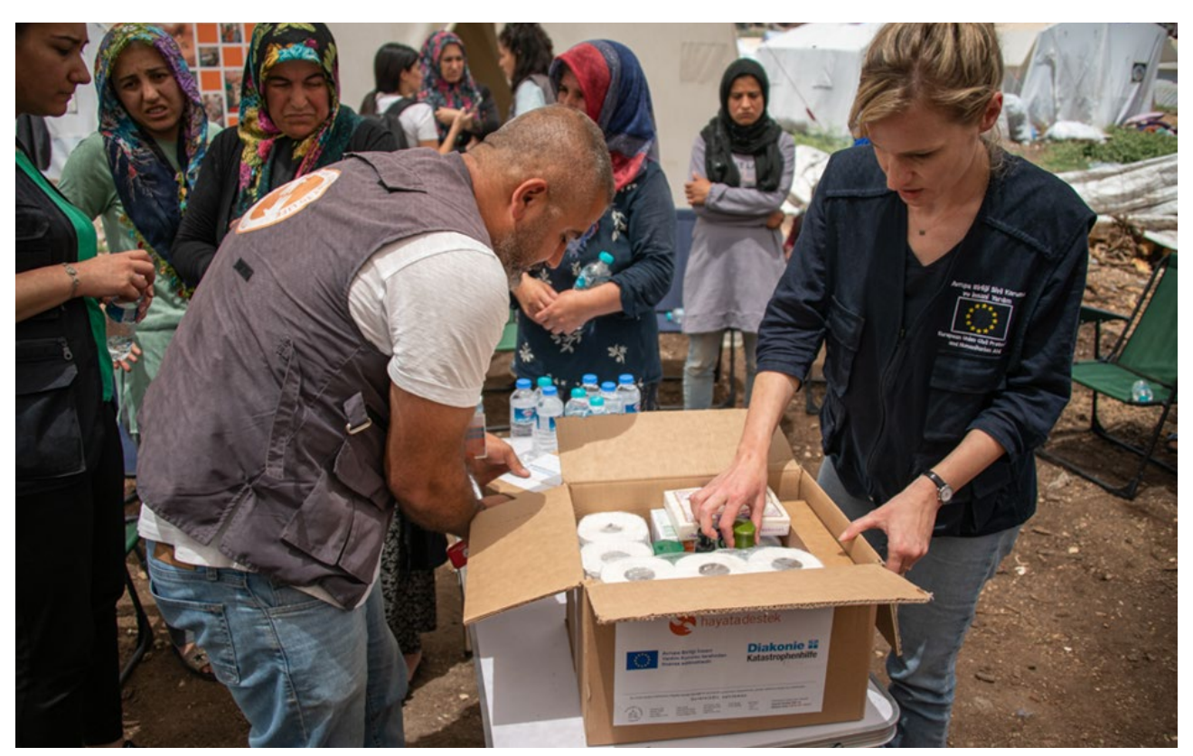
Türkiye: responding to the needs of earthquake-affected people

Slovenia has made commitments regarding its humanitarian aid, pledging to allocate at least 10% of it towards prevention, disaster risk reduction, and resilience strengthening by 2020, a commitment reiterated in the National Development Cooperation and Humanitarian Aid Strategy by 2030. In alignment with this pledge, the country is funding various NGO projects focused on prevention and disaster risk reduction, particularly in areas such as sustainable farming and access to potable water. The annual public call for humanitarian and development projects mandates submissions to incorporate activities targeting climate change and environmental protection alongside other initiatives. Projects within the humanitarian-development-peace (HDP) nexus are designed with climate change and environmental considerations from their inception, including assessments of the environmental state in project areas, anticipated environmental effects, legislative frameworks, and community/stakeholder capacities to address environmental challenges. Environmental impact assessments encompass Sustainable Development Goals (SDG)-related subgoals and project contributions to their achievement.