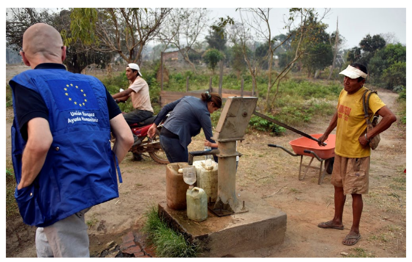
Throwback: EU's response to forest fires in Bolivia

Austria reported that in the accreditation process for humanitarian aid, relevant partner processes and mechanisms are reviewed to ensure corresponding quality standards are fulfilled. In particular, it has to be ensured that any negative impacts of interventions on the environment are avoided and that climate change, mitigation and adaptation measures are included in interventions (e.g. reduction of greenhouse gases, sustainable production/agriculture, sustainable resource management, disaster management, etc.). Austria's project applications and report forms include a section on environmental standards, potential risks and risk mitigation measures with regards to environmental impacts.