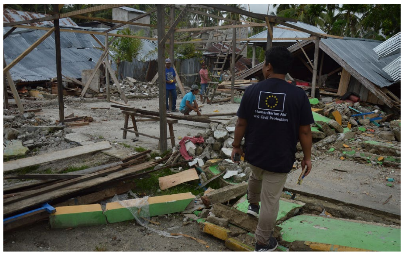
Indonesia: EU response to Sulawesi earthquake