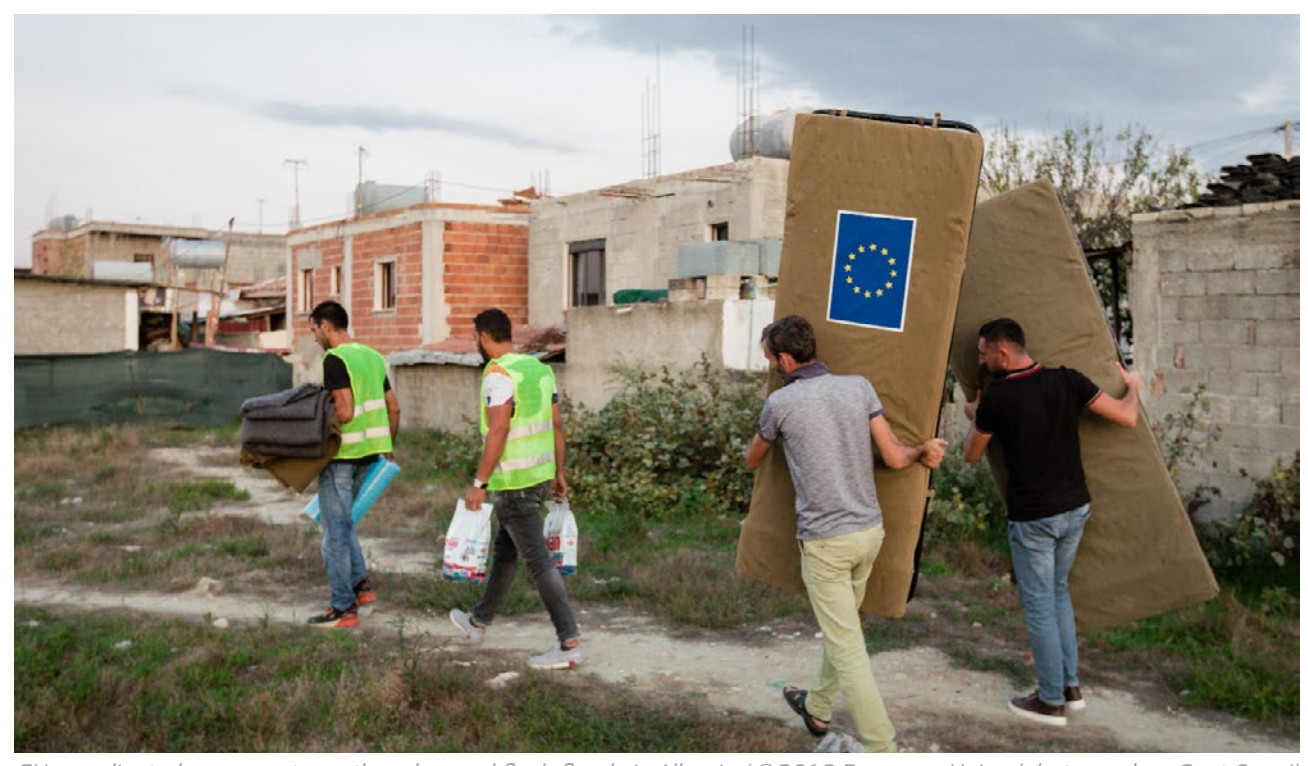
EU-coordinated response to earthquakes and flash floods in Albania

The European Union implements programmes in the field of Disaster Risk Prevention and Reduction that contribute to the goals of the Donors' Declaration for a core of approximately EUR 160 million through its development budget. The main programmes are: CLIMSA - Intra-ACP Climate Services and Related Applications programme and the Intra-ACP Natural Disaster Risk Reduction Programme - NDRRP (through the 11th EDF). Through the humanitarian budget, the EU also supports targeted disaster preparedness actions, with a total envelope of EUR 76 million for 2023 and EUR 79 million for 2024. In line with its Disaster Preparedness approach, all EU-funded humanitarian projects should also be risk-informed to minimize the impact of current and future natural and man-made risks on the implementation of the project.