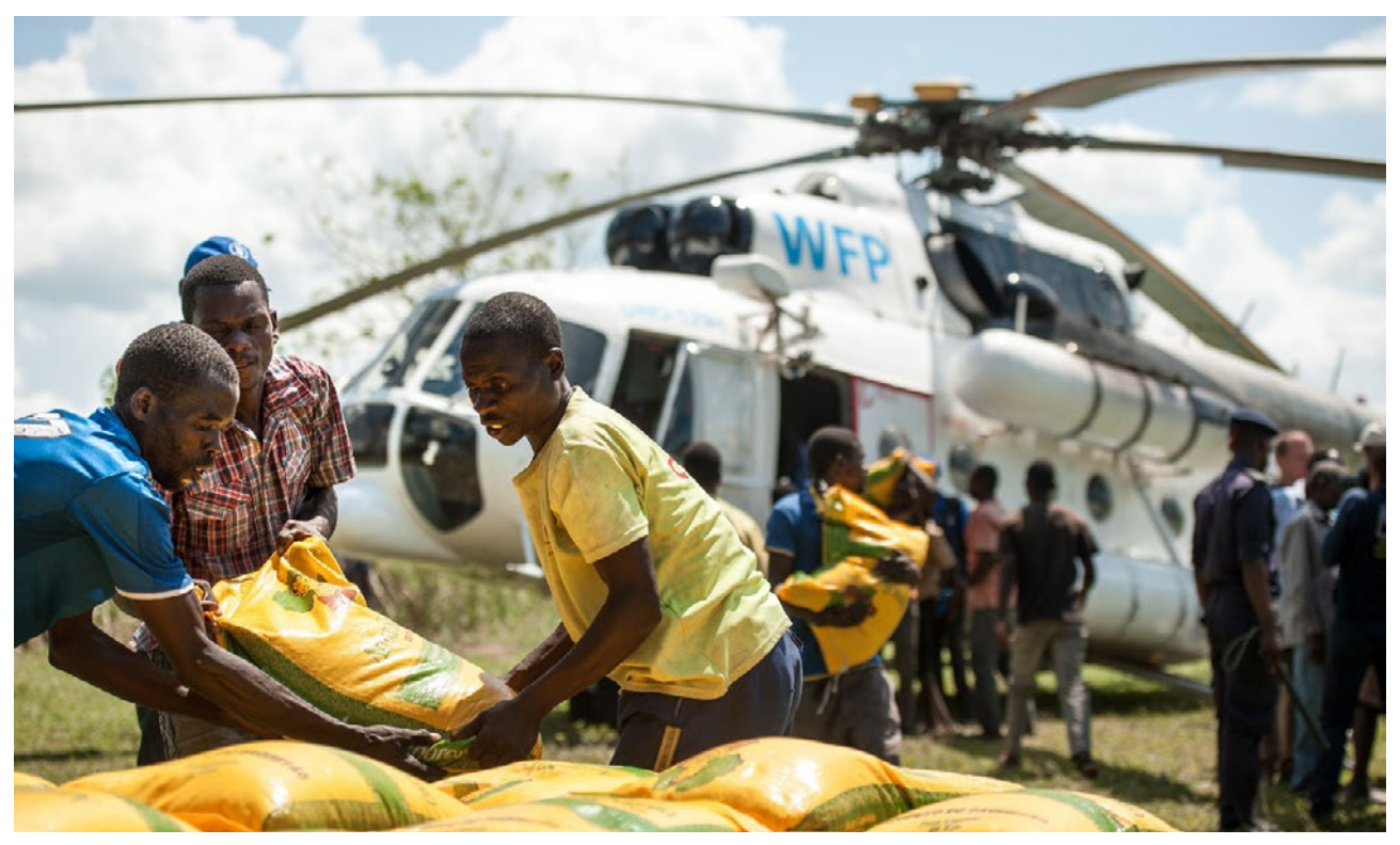
EU response to cyclone Idai in Mozambique

environment and natural resources. Such restoration efforts should demonstrate the benefits that this brings to affected persons, by improving their living conditions, creating opportunities for income generation, and improving nutrition and water quality, and access to natural resources for which people rely on for their livelihoods. Countries or areas where little to no restoration efforts have taken place in humanitarian contexts were prioritised, and ultimately the informal settlements in Northern Iraq were selected for a pilot. The project will involve the displaced communities and the host populations as active agents.