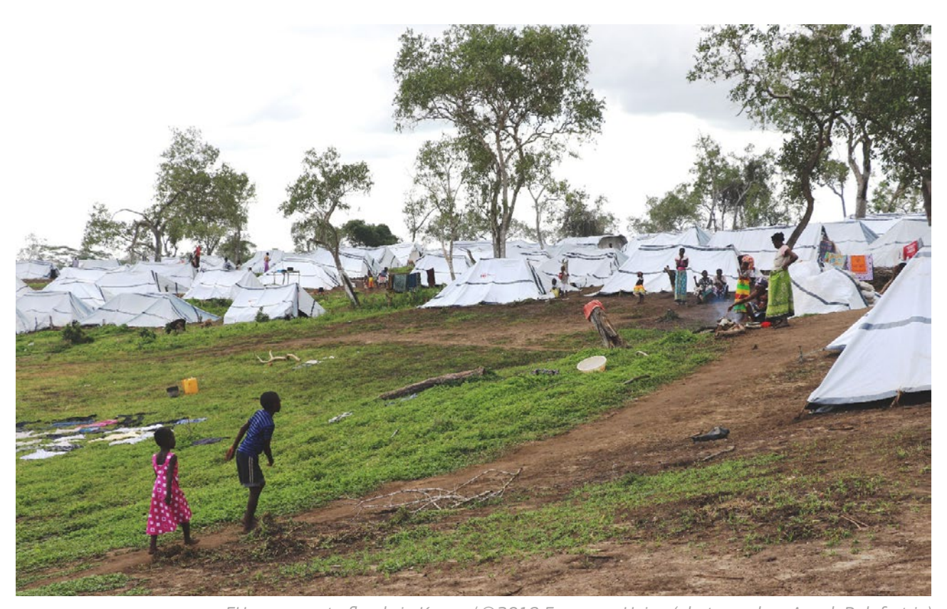
EU response to floods in Kenya

Some Signatories<sup>16</sup> are actively scaling up cash transfers. Italy, as per the Grand Bargain workstream 3, is committed to increasing the use and coordination of cash-based programming and transfers. Austria's new Strategy on Humanitarian Assistance promotes the use of cash transfers. Slovenia, since 2022, has been supporting cash and voucher programs with regular contributions to CERF. Sweden reported that scaling up cash transfers is an ambition for Sida's work with humanitarian assistance, and many partners also see cash transfers as a preferred greener option when possible. Sida supports the CALP Network via Oxfam, which focuses on cash and voucher assistance policy and advocacy and annually publishes the State of the World's Cash report. The EU is committed to prioritising cash over in-kind assistance through its humanitarian aid budget, with dedicated Thematic Policy Document on Cash Transfers. In case cash is not chosen as the modality, partners are asked to justify this when submitting proposals.