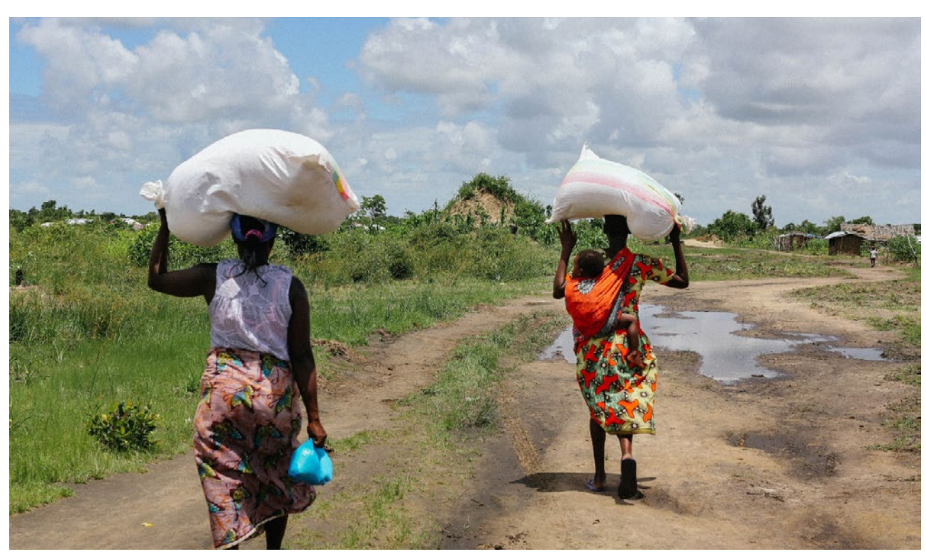
Mozambique: one year after cyclone Idai

More than 27 million children were driven into hunger and malnutrition by extreme weather events in countries heavily impacted by the climate crisis in 2022, which was a 135% jump from the previous year, according to a new data analysis by Save the Children ahead of COP28. The 12 countries where weather extremes were the primary driver of hunger in 2022, according to the IPC, were Angola, Burundi, Ethiopia, Iraq, Kenya, Madagascar, Malawi, Pakistan, Somalia, Tanzania, Uganda, and Zambia.