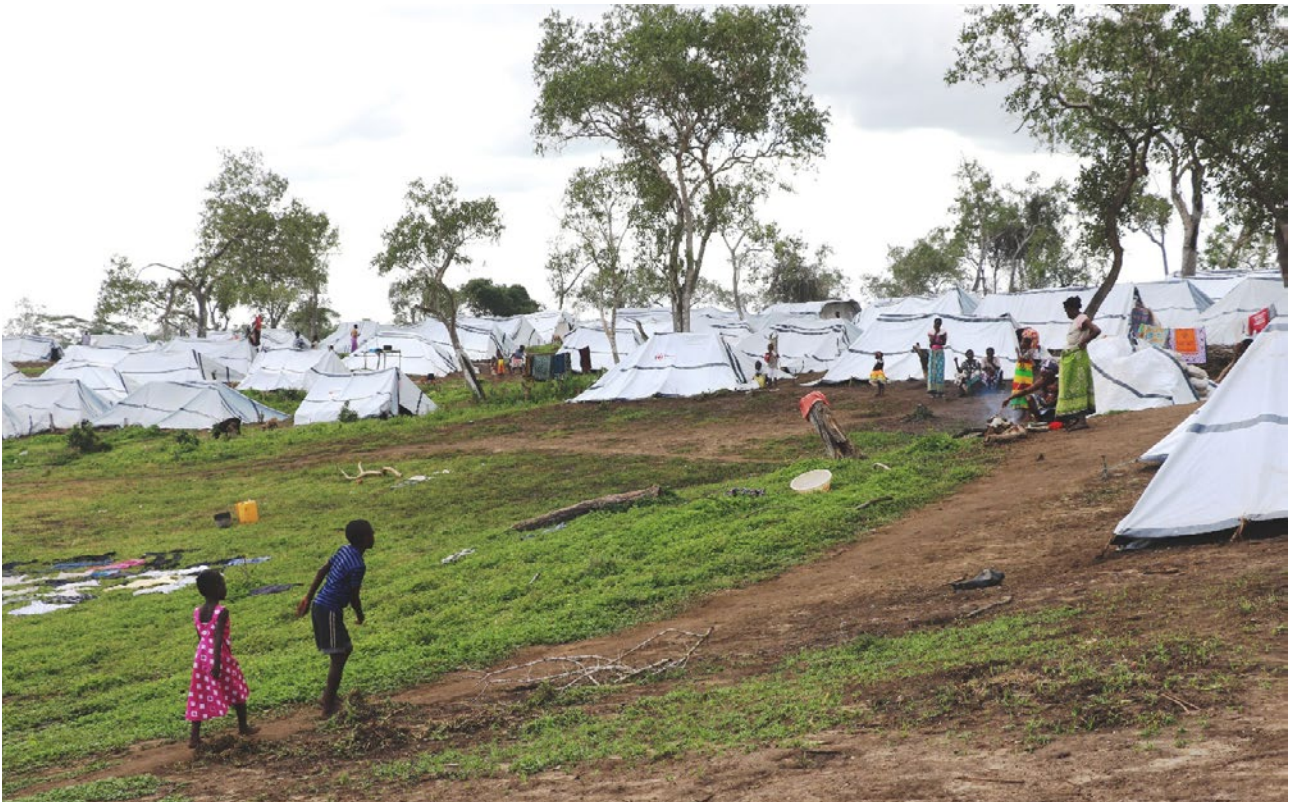
EU response to floods in Kenya

Some Signatories 16 are actively scaling up cash transfers. Italy, as per the Grand Bargain workstream 3, is committed to increasing the use and coordination of cash-based programming and transfers. Austria's new Strategy on Humanitarian Assistance promotes the use of cash transfers. Slovenia, since 2022, has been supporting cash and voucher programs with regular contributions to CERF. Sweden reported that scaling up cash transfers is an ambition for Sida's work with humanitarian assistance, and many partners also see cash transfers as a preferred greener option when possible. Sida supports the CALP Network via Oxfam, which focuses on cash and voucher assistance policy and advocacy and annually publishes the State of the World's Cash report. The EU is committed to prioritising cash over in-kind assistance through its humanitarian aid budget, with dedicated Thematic Policy Document on Cash Transfers. In case cash is not chosen as the modality, partners are asked to justify this when submitting proposals.