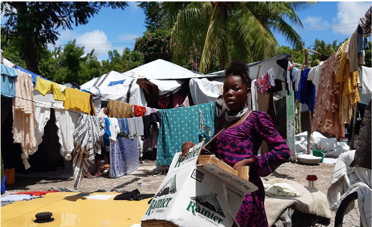
Haiti: EU response to devastating earthquake

Water at the Heart of Climate Action is a new initiative of EUR 55 million, funded by the Dutch Ministry of Foreign Affairs, and implemented by IFRC and the Netherlands Red Cross, UNDRR and WMO. The initiative is geared towards mitigating the impacts of water-related risks and disasters and increasing the resilience of vulnerable communities in Ethiopia, Sudan, South Sudan and Uganda. This initiative aims to enable different actors at global, national and local level to more effectively manage water-related risks. The Netherlands notes that global and national policies on climate, disaster risk reduction and water are often siloed and disconnected from, and not informed by the actors at, the local level. The Netherlands believes that to adapt to a changing climate, a combination of early warning and early action measures that support integrated water management is necessary to save lives and livelihoods in vulnerable communities. This initiative takes the local perspective as the starting point and includes vulnerable groups in the design of interventions aimed at reducing their vulnerabilities and strengthening their capacities. It focuses on long-term resilience strengthening measures and targeted action to improve the forecasting and early warning system capacity of regional and national actors.