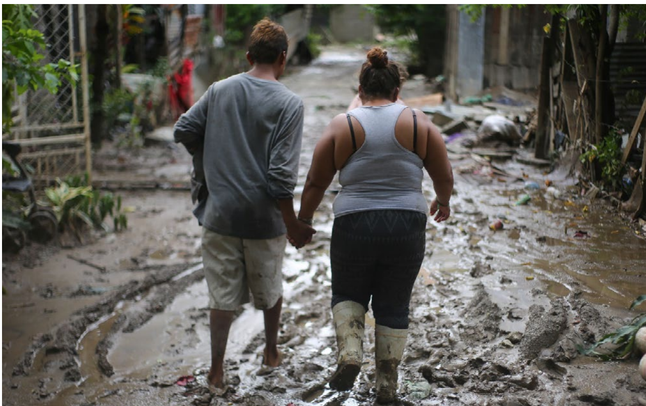
EU solidarity: helping Central America recover after hurricanes ETA and IOTA

Following the various commitments made by the European Commission to scale up Anticipatory Action in the 2021 Communication on Humanitarian Aid, the 2022 G7 Statement on Anticipatory Action, and the 2023 'Getting Ahead of Disasters' Charter launched at COP28, among others, the European Commission's humanitarian department developed a Roadmap in 2023 to test several approaches to increase its investment in Anticipatory Action. This includes support of EUR 2 million in 2023 to the Start Ready initiative, a pooled fund focusing specifically on Anticipatory Action, managed by the Start Network, as well as piloting the use of Crisis Modifiers for Anticipatory Action in a more efficient and coherent way. The EU continues funding the 'build' component through its Disaster Preparedness Budget Line, a part of its humanitarian budget, to support capacity-building efforts to gather data and establish necessary systems. The EU also continues to support anticipatory action by financing the DREF from its humanitarian budget.