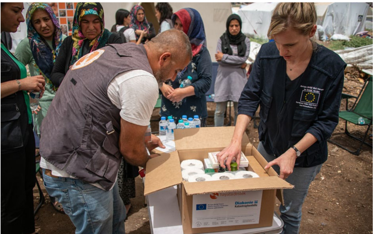
Türkiye: responding to the needs of earthquake-affected people

Slovenia has made commitments regarding its humanitarian aid, pledging to allocate at least 10% of it towards prevention, disaster risk reduction, and resilience strengthening by 2020, a commitment reiterated in the National Development Cooperation and Humanitarian Aid Strategy by 2030. In alignment with this pledge, the country is funding various NGO projects focused on prevention and disaster risk reduction, particularly in areas such as sustainable farming and access to potable water. The annual public call for humanitarian and development projects mandates submissions to incorporate activities targeting climate change and environmental protection alongside other initiatives. Projects within the humanitarian-development-peace (HDP) nexus are designed with climate change and environmental considerations from their inception, including assessments of the environmental state in project areas, anticipated environmental effects, legislative frameworks, and community/stakeholder capacities to address environmental challenges. Environmental impact assessments encompass Sustainable Development Goals (SDG)-related subgoals and project contributions to their achievement.