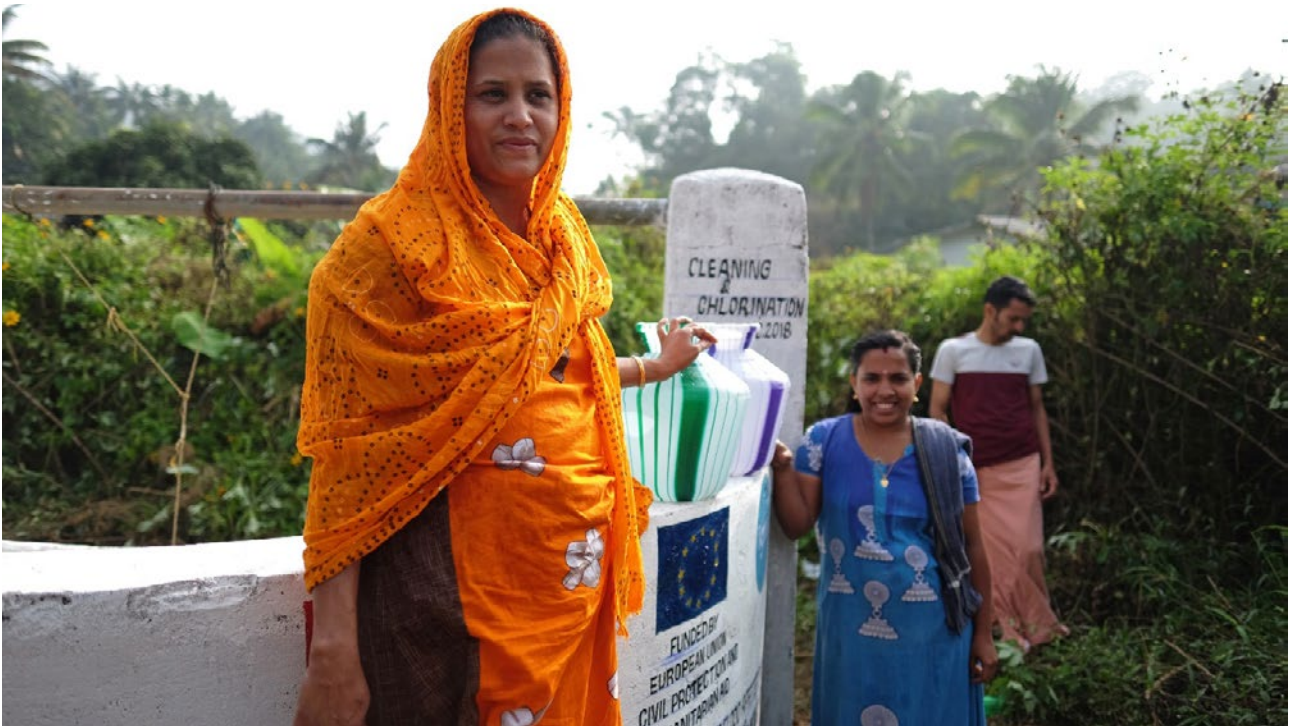
Providing support to flood-stricken families in India