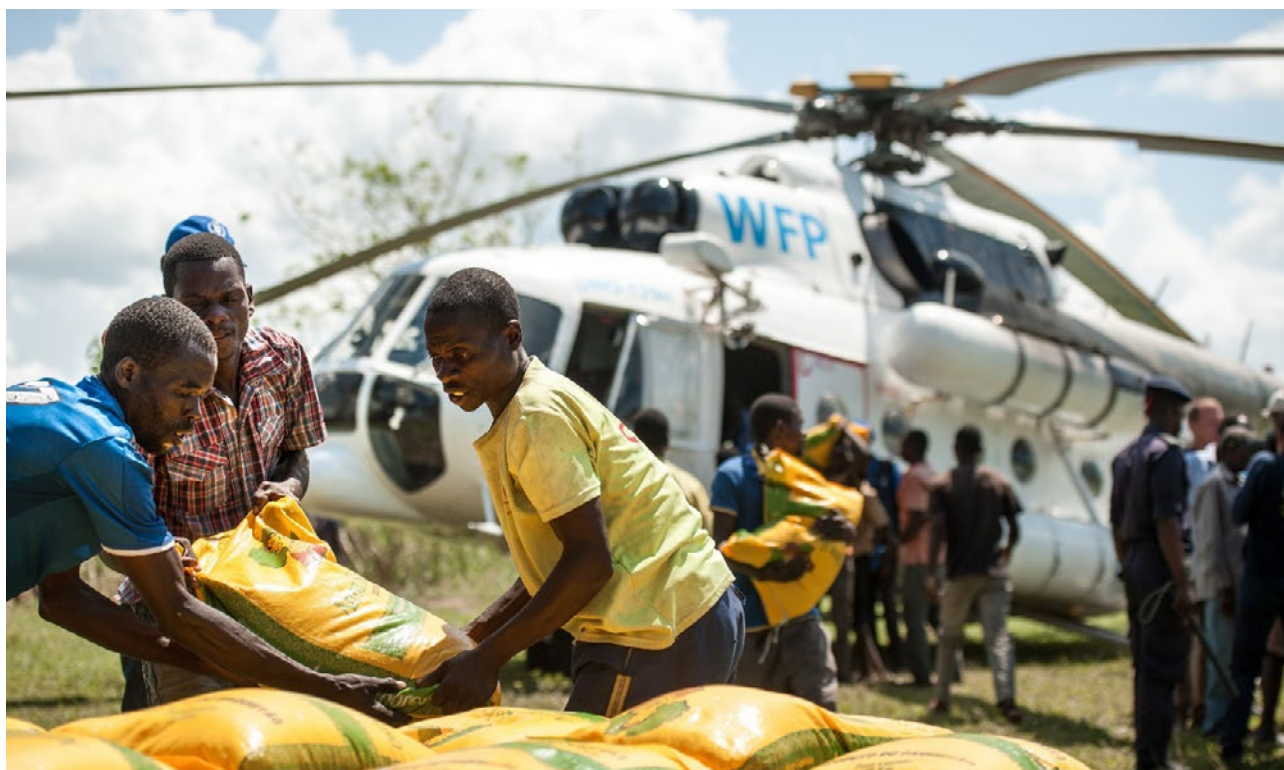
EU response to cyclone Idai in Mozambique

environment and natural resources. Such restoration efforts should demonstrate the benefits that this brings to affected persons, by improving their living conditions, creating opportunities for income generation, and improving nutrition and water quality, and access to natural resources for which people rely on for their livelihoods. Countries or areas where little to no restoration efforts have taken place in humanitarian contexts were prioritised, and ultimately the informal settlements in Northern Iraq were selected for a pilot. The project will involve the displaced communities and the host populations as active agents.