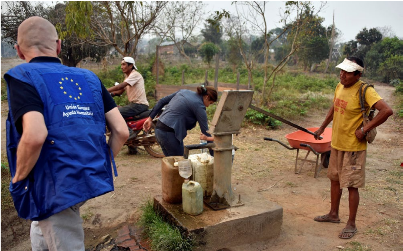
Throwback: EU's response to forest fires in Bolivia

Austria reported that in the accreditation process for humanitarian aid, relevant partner processes and mechanisms are reviewed to ensure corresponding quality standards are fulfilled. In particular, it has to be ensured that any negative impacts of interventions on the environment are avoided and that climate change, mitigation and adaptation measures are included in interventions (e.g. reduction of greenhouse gases, sustainable production/agriculture, sustainable resource management, disaster management, etc.). Austria's project applications and report forms include a section on environmental standards, potential risks and risk mitigation measures with regards to environmental impacts.