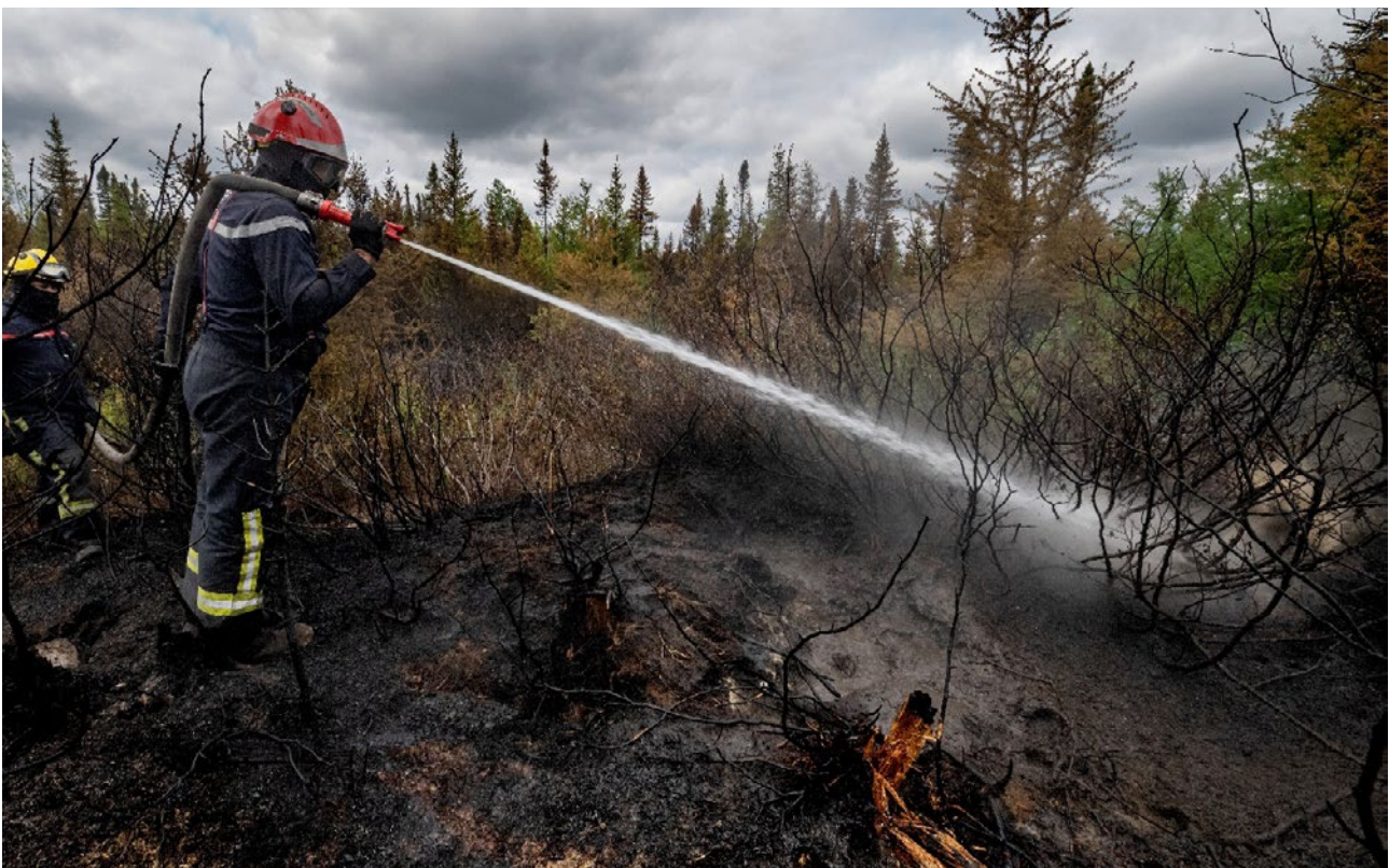
Canada: EU response to wildfires

The EU fosters cooperation and partnerships in several ways. For instance, the EU supports the need to strengthen the international framework for responding to the climate risks of today and the future, and that there is an urgent need to scale up financing, particularly to support the most vulnerable to deal with loss and damages resulting from climate change. Therefore, the EU welcomed the COP28 decision on the operationalisation of the Loss and Damage new funding arrangements and the Fund, to address climate related loss and damage in particularly vulnerable developing countries, while also supporting both the achievement of international goals on sustainable development and the eradication of poverty. The Fund was successfully launched with the European Commission pledging EUR 25 million and individual pledges announced by EU Member States amounting to over EUR 350 million. Equally relevant is the adoption of the UAE Framework for Global Resilience at COP28 and its agreed targets, which provides leverage for enhanced coordination and collaboration between existing structures and climate adaptation processes within and outside the UNFCCC.