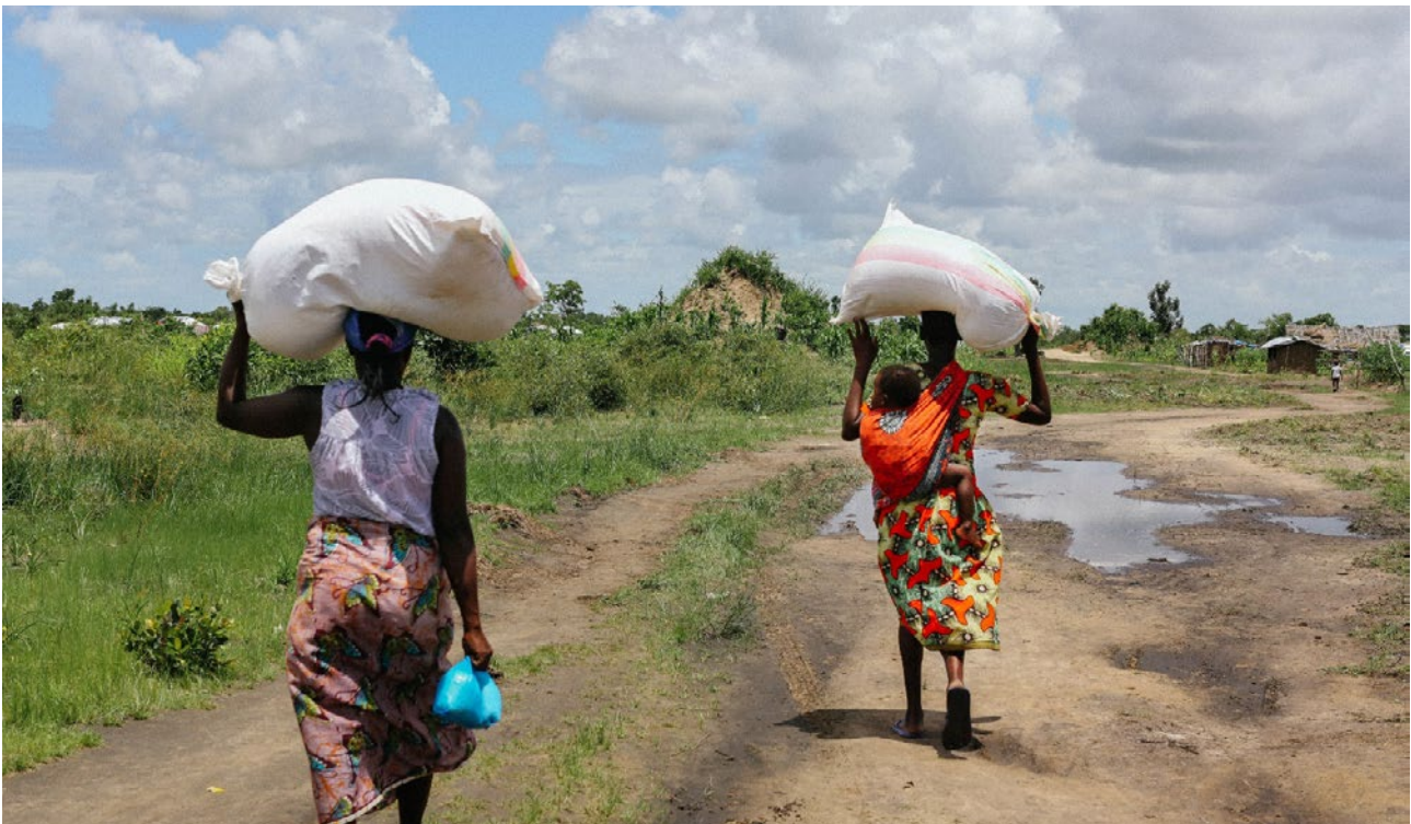
Mozambique: one year after cyclone Idai

More than 27 million children were driven into hunger and malnutrition by extreme weather events in countries heavily impacted by the climate crisis in 2022, which was a 135% jump from the previous year, according to a new data analysis by Save the Children ahead of COP28. The 12 countries where weather extremes were the primary driver of hunger in 2022, according to the IPC, were Angola, Burundi, Ethiopia, Iraq, Kenya, Madagascar, Malawi, Pakistan, Somalia, Tanzania, Uganda, and Zambia.