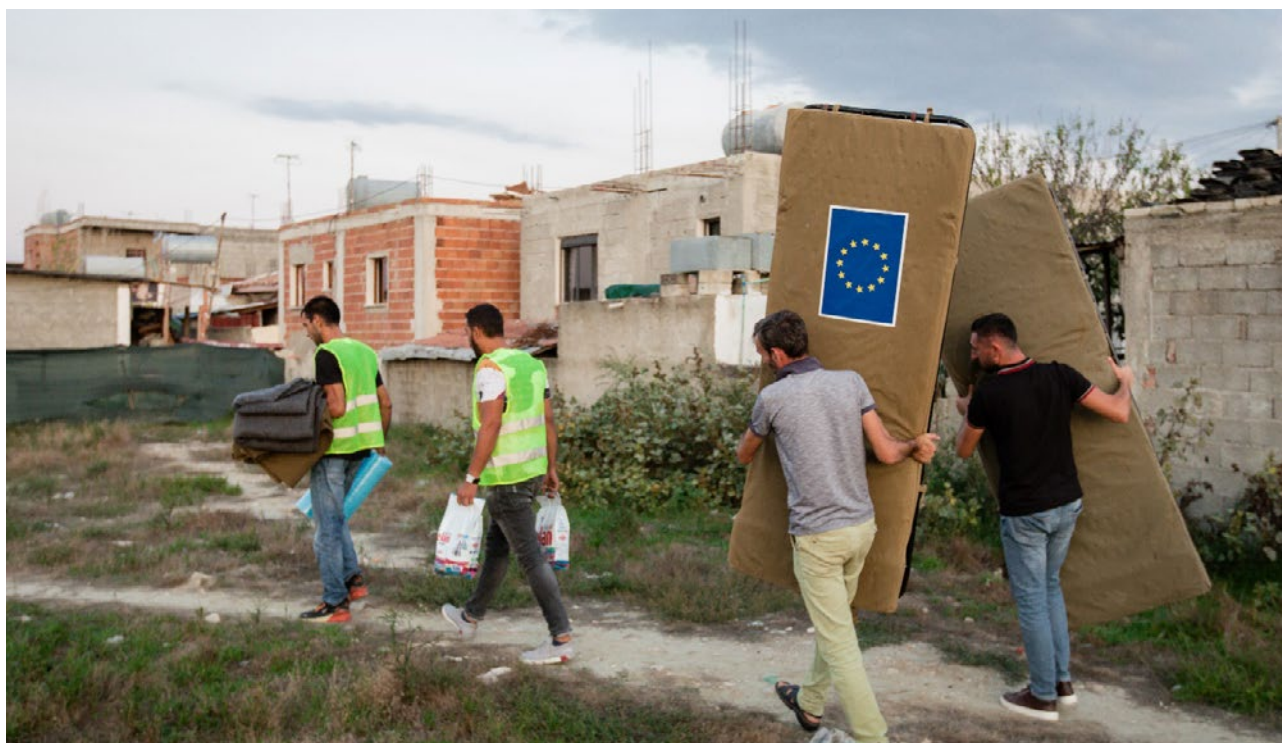
EU-coordinated response to earthquakes and flash floods in Albania

The European Union implements programmes in the field of Disaster Risk Prevention and Reduction that contribute to the goals of the Donors' Declaration for a core of approximately EUR 160 million through its development budget. The main programmes are: CLIMSA - Intra-ACP Climate Services and Related Applications programme and the Intra-ACP Natural Disaster Risk Reduction Programme - NDRRP (through the 11th EDF). Through the humanitarian budget, the EU also supports targeted disaster preparedness actions, with a total envelope of EUR 76 million for 2023 and EUR 79 million for 2024. In line with its Disaster Preparedness approach, all EU-funded humanitarian projects should also be risk-informed to minimize the impact of current and future natural and man-made risks on the implementation of the project.