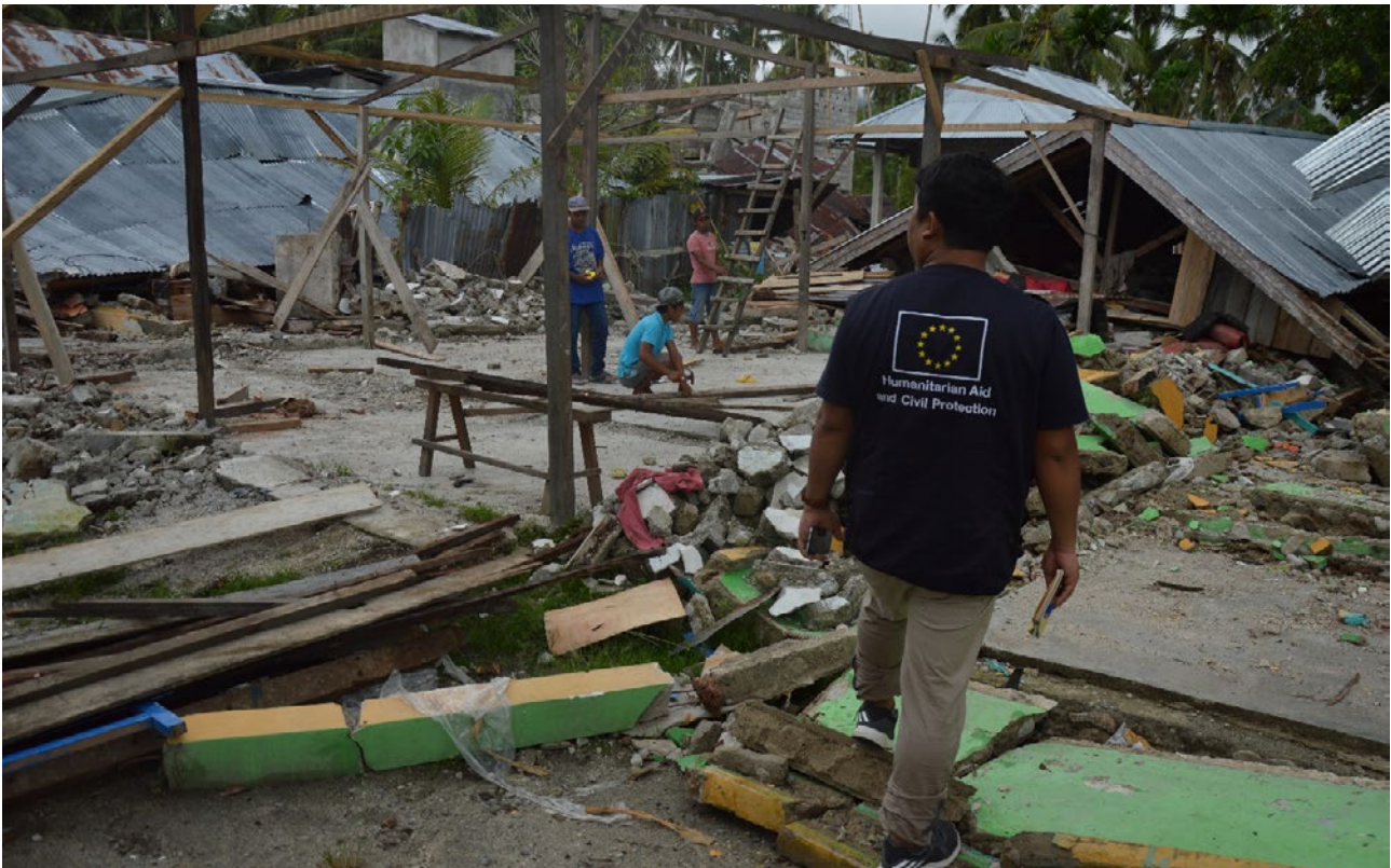
Indonesia: EU response to Sulawesi earthquake