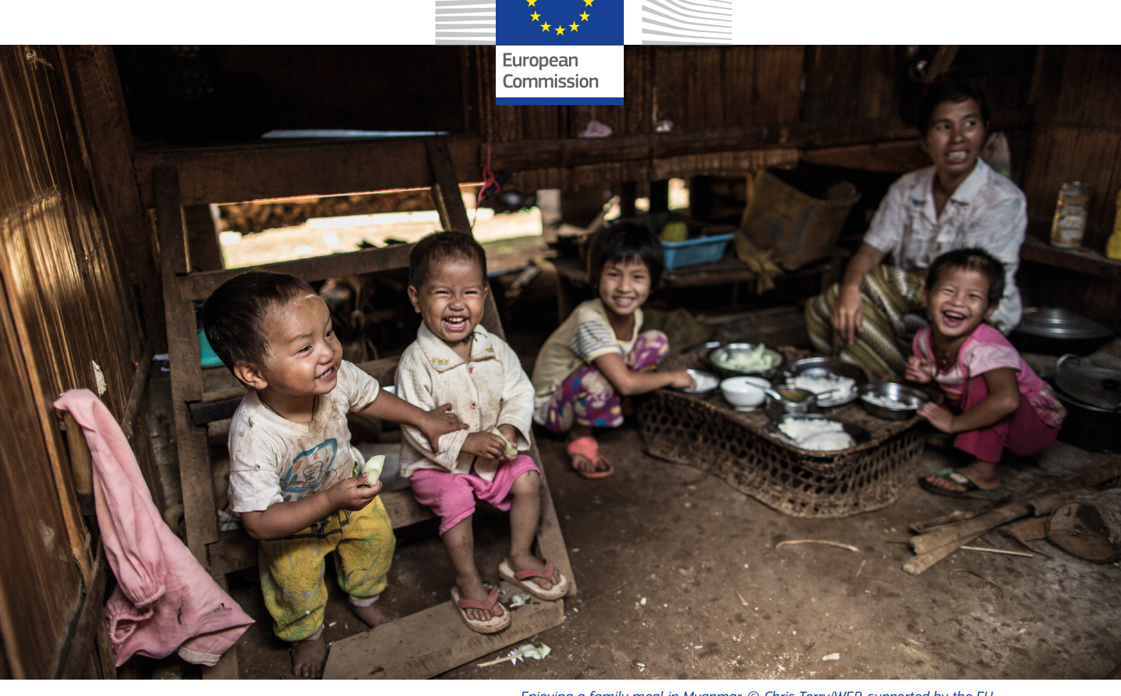
Enjoying a family meal in Myanmar.