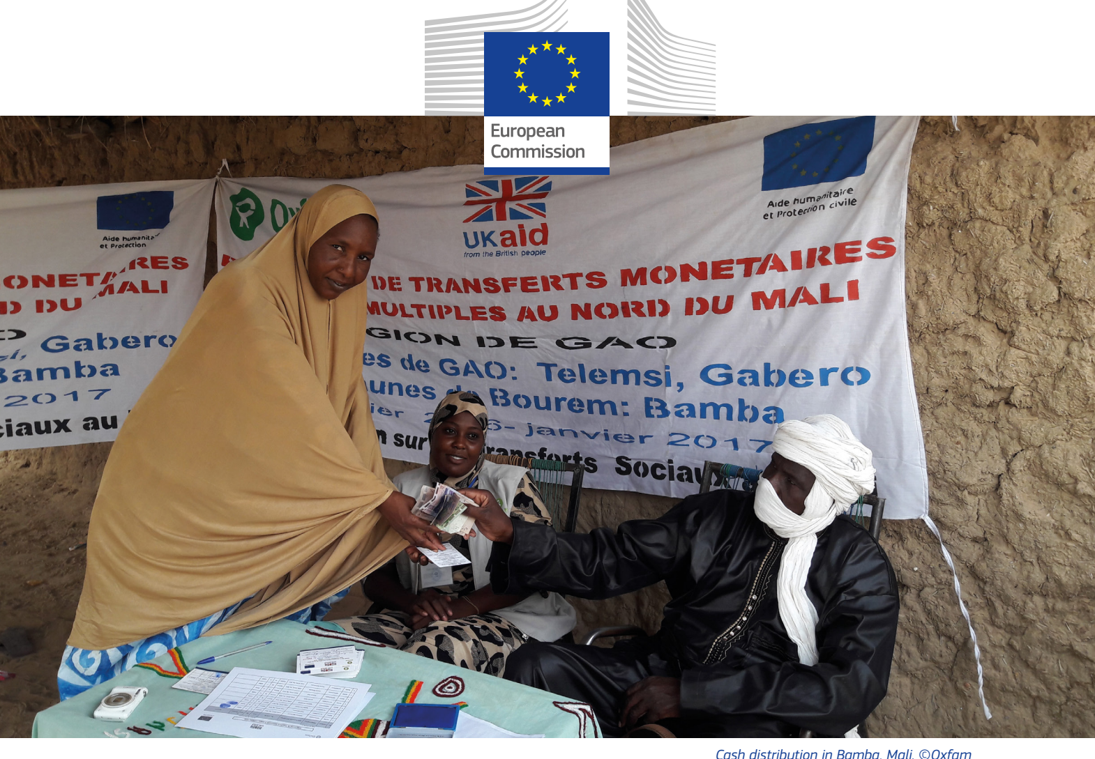
Cash distribution in Bamba, Mali.