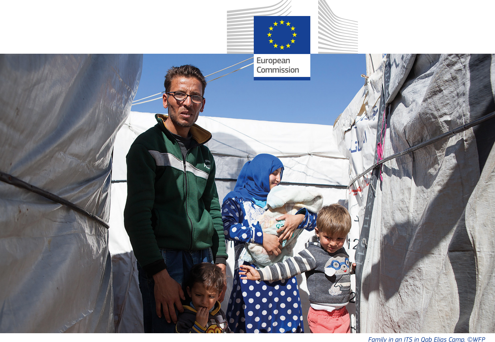
Family in an ITS in Qab Elias Camp.