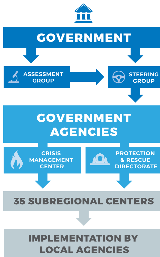
Figure 3: Overview of North Macedonian DRM governance

The hierarchy of North Macedonia's DRM entities can be visualised as follows: