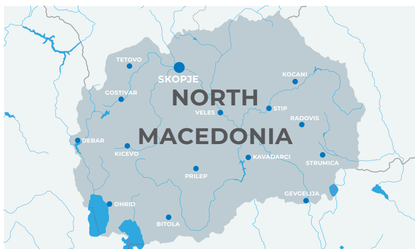
Figure 2: Map of North Macedonia

The capital – Skopje (Скопје) – is home to approximately a quarter of the country's total population. Ethnic Macedonians make up the majority of the country's population (64.2 %), with Albanians (25.2 %), Turks (3.9 %), Romani (2.7 %) and Serbs (1.8 %) making up the remainder. The country's geography is defined primarily by mountains, valleys and rivers.